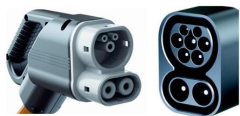
CCS2 charging plug and socket

The I-Pace is fitted with a CCS2 socket allowing it to charge via AC as well as via CCS2 DC fast-chargers.