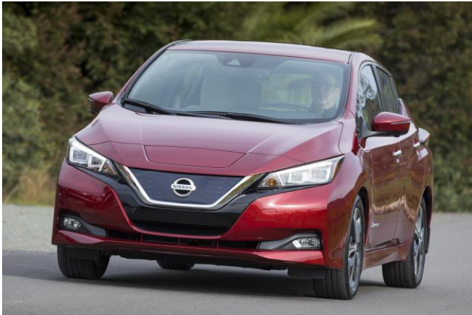
ZE1 Leaf.