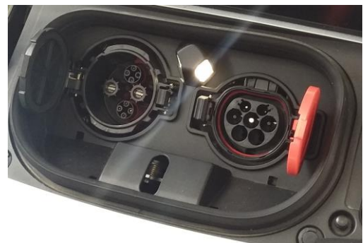
Nissan ZE1 Leaf charging ports (Type 2 AC on right, CHAdeMO DC on left)

The ZE1 Leaf is fitted with a Type 2 AC socket and a CHAdeMO socket for DC charging.